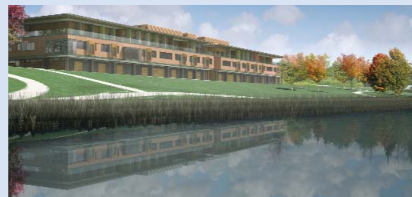
Views to the Camowen River