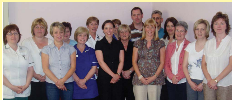
Some representatives of the Omagh Project's Staff Design Forum

The Forum performs a formal evaluation of the design and applies a recognised healthcare design evaluation tool called ASPECT (A Staff and Patient Environment Calibration Toolkit). During a series of 3 workshops held at DBS HQ the group has already conducted a formal ASPECT evaluation of the exemplar design for the Hospital Complex. The results of this evaluation have been presented to the Design Team who are addressing the issues raised in the development of the exemplar design for the project. The next stage will involve meeting with Bidders to discuss their design approach. The Forum will continue to challenge developments throughout the procurement process.