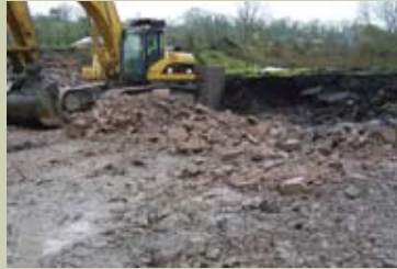
Far left: work is underway redirecting the power lines underground Above left: developing the access road Above right: laying the roundabout Left: Progress Continues

The programme of site preparation works continues at Wolf Lough and is on-track for completion by April 2008.