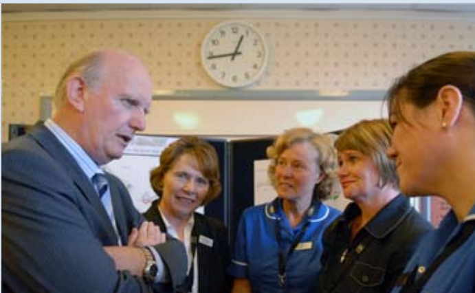
Minister McGimpsey speaks with staff about the plans for the New Hospitals.