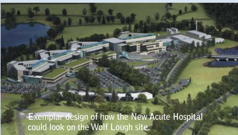
Exemplar design of how the New Acute Hospital could look on the Wolf Lough site.

You have asked us to show the precise location for the new Acute Hospital. The site will be marked by a large sign to highlight its location in the coming weeks.