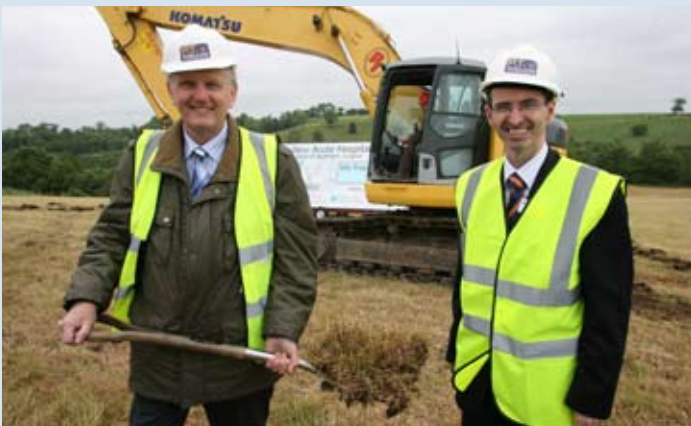
Minister cuts the first sod at the site of the New Acute Hospital.