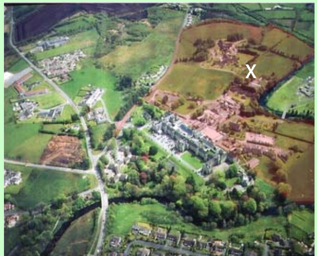
The red shaded area on the photograph above is the site area identified for the new Hospital Complex. The location of the hospital graveyard is marked with a white X.

Our Autumn DBS staff bulletin will feature more detailed information on the Omagh Hospital Complex including the profile of services for 2011/12.